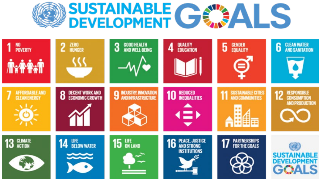
Figure 1: Sustainable Development Goals (SDGs) outlined by United Nations General Assembly (UN-GA)